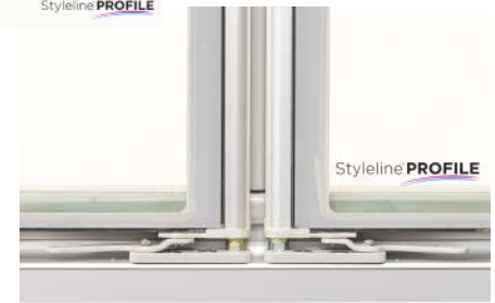
Bottom Door Hinge