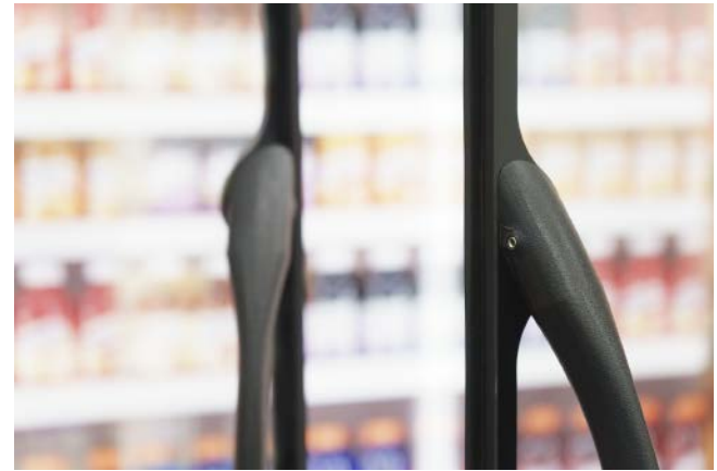
Elegant design door handle