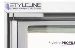
Top Door Hinge